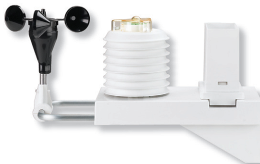
ET System Sensor (Shown with optional ET WIND)

T ake the guesswork out of irrigation scheduling, by tracking your local microclimate and automatically calculating a scientific irrigation program! The Hunter ET System is an easy-to-add-on accessory (for any Hunter controller that operates with a SmartPort® system) that measures key climatic conditions, and uses them to calculate your local Evapotranspiration (ET) factor. The ET is then downloaded into your irrigation controller to create an irrigation program that is just right for your sprinkler system, plants, and soil conditions. By taking into account the rate at which water is consumed