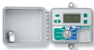
ET System Module

Gathers weather data on site, continuously calculates the ideal program for your landscape