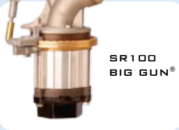
SR100 BIG GUN®