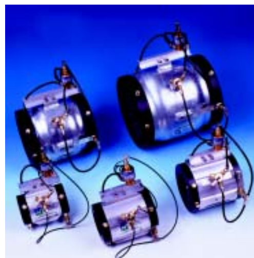
800 SERIES CONTROL VALVES